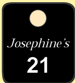
MP-172 (1 1/2" x 1 3/4") Red, Blue, Green, Black