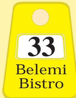
MP-234 (1 1/2" x 2") Red, Blue, Green, Yellow