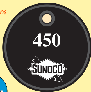
MP-338 2" diameter. 1/4" hole