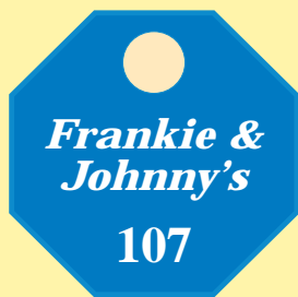
MP-169 (1 3/4" x 1 3/4") Red, Blue, Green, Black